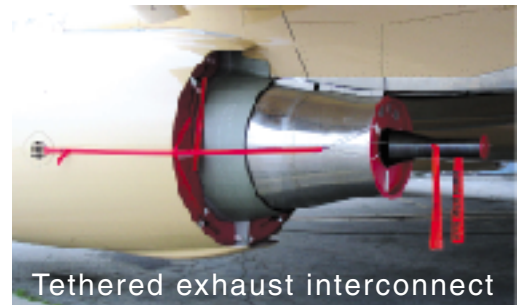
Tethered exhaust interconnect

No drilling is required for the installation and/or operation of any Jet \ Brella inlet, exhaust, or APU cover.